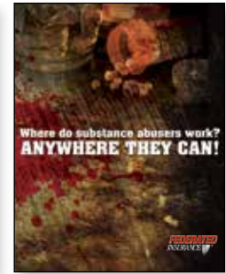
Drug- and Alcohol-Free Workplace Program

Yes! I would like to receive complimentary risk management materials from Federated Insurance.