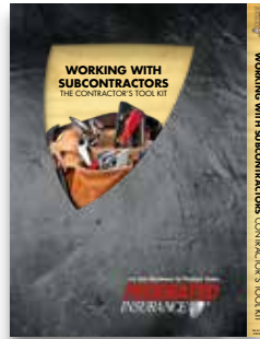
Contractor's Tool Kit—Working with Subcontractors