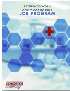
Return-to-Work and Modified Duty Program